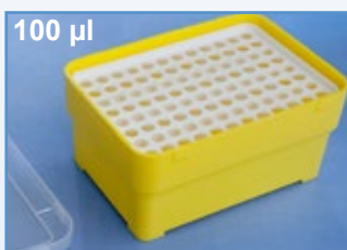
Cat. No.: 973 202