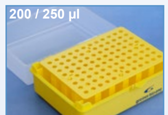
Cat. No.: 941 315