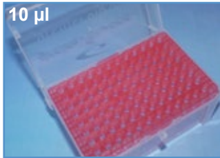
Cat. No.: 970 310