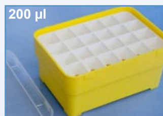
Cat. No.: 973 270