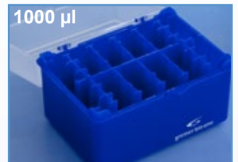
Cat. No.: 941 320