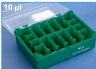
Cat. No.: 941 300