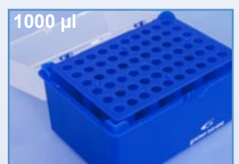
Cat. No.: 941 325

For further information and/or sample ordering please visit our website www.gbo.com or contact us.