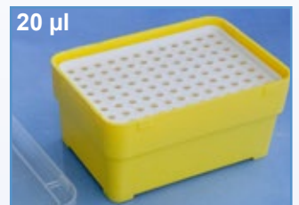
Cat. No.: 973 272