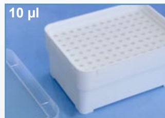
Cat. No.: 973 276