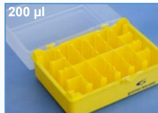
Cat. No.: 941 310