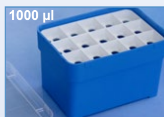
Cat. No.: 974 290