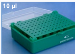
Cat. No.: 941 305