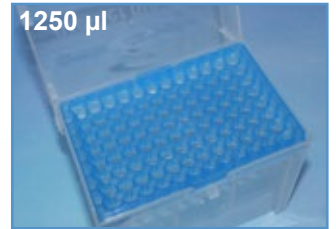
Cat. No.: 970 350