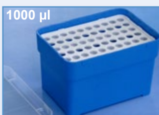
Cat. No.: 974 280