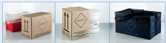
Carton for VTB

The “UN 3373” symbol together with the text “Biological Substance, Category B” is printed on it.