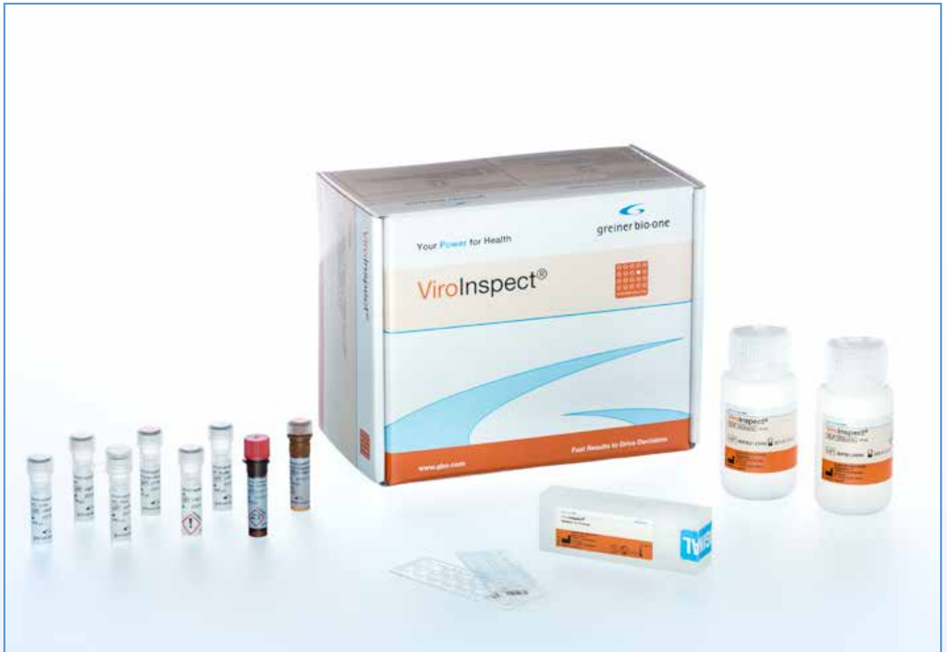
Figure 3: ViroInspect® Kit content