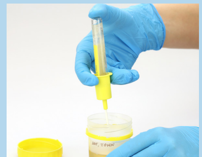
Urine Transfer Device for easy and hygienic sample transfer