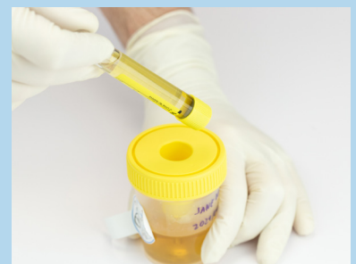
Urine Cup with Integrated Transfer Device