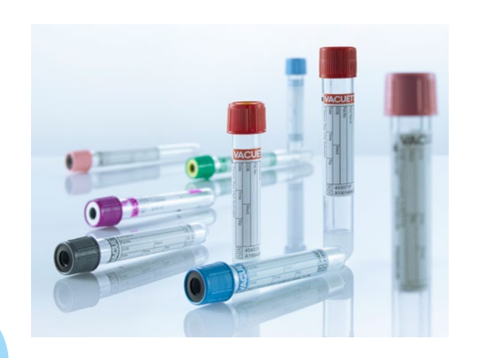
Take samples (correct order of draw) + invert the tubes