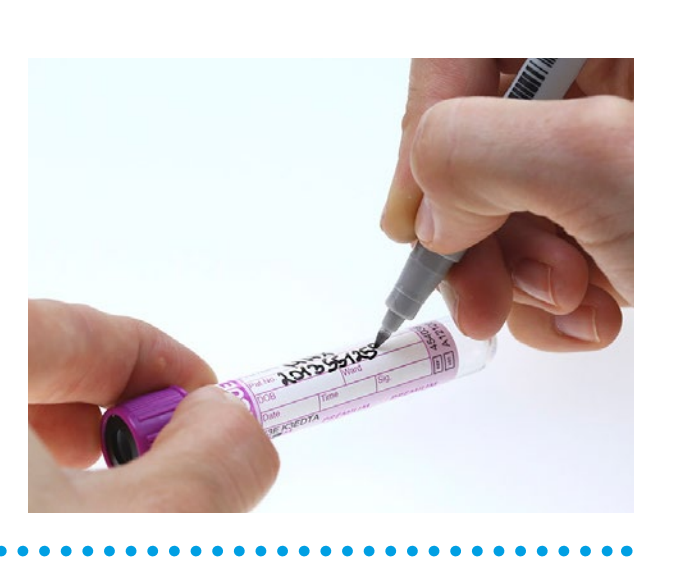
Label the tube