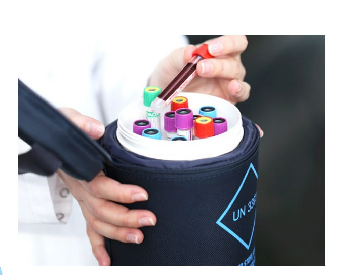
Special handling recommendations and transport