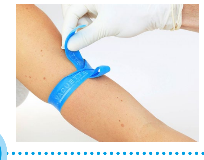
Release the tourniquet