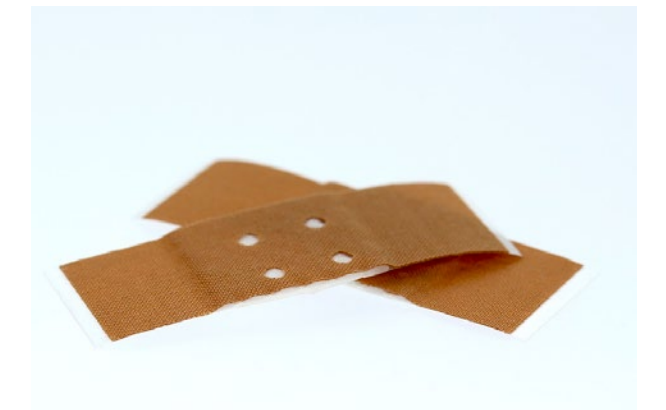
Cleaning and wound dressing