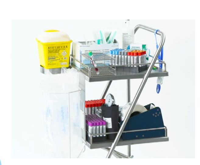
Ensure all the required products are available