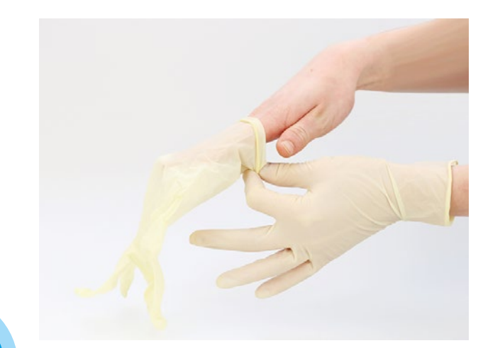
Hand hygiene, put on gloves