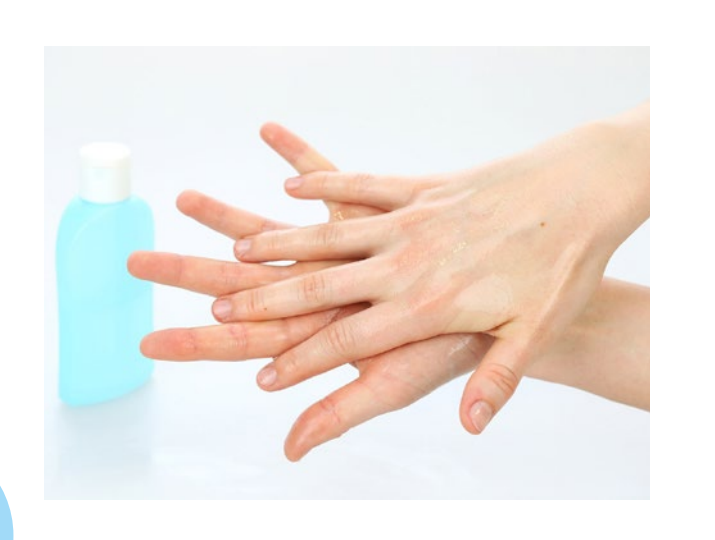
Farewell, disposal, cleaning and hand disinfection

WHO guidelines on drawing blood best practices in phlebotomy WHO (2010)