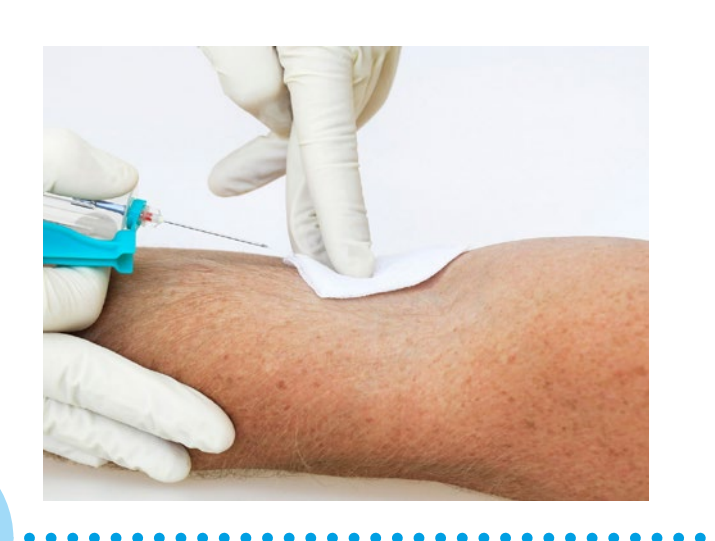
Withdraw and dispose of the needle