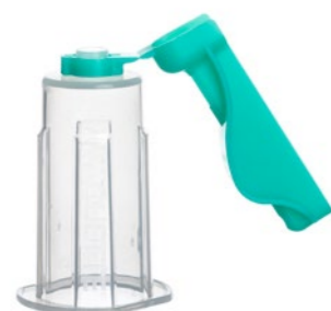
VACUETTE® QUICKSHIELD Safety Tube Holder

As a combination product with a pre-assembled needle, the product comes individually packed in sterile blister packaging.