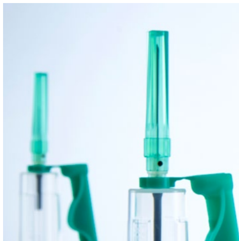
A dot on the needle protection cap indicates the position of the needle tip to enable precise puncture.