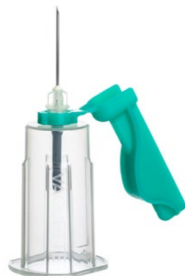
VACUETTE® QUICKSHIELD Complete PLUS

The individually packaged product is ready for immediate use without any further steps.