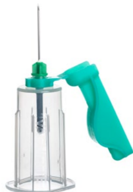
VACUETTE® QUICKSHIELD Complete

The holder can be used with either VACUETTE® Multiple Use Drawing Needles or with VACUETTE® VISIO PLUS Needles.