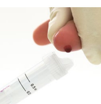
Collect the blood sample.