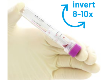
Immediately after collection, invert the tube gently.