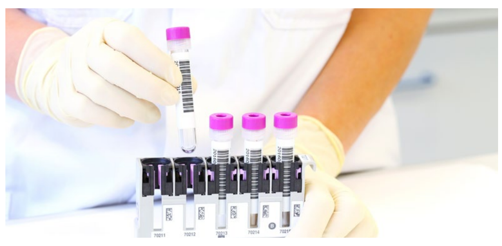
MiniCollect® Complete can be processed in a standard centrifuge.