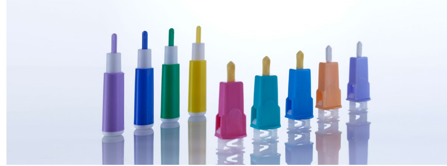
The lancets are colour-coded for easy identification of puncture depth and application.