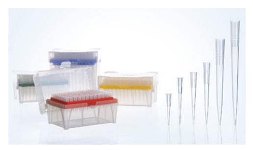
Sapphire pipette tips