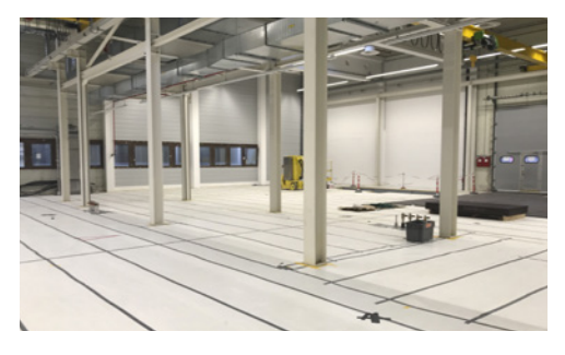
Infrastructure project at the Frickenhausen site, Germany

The production location in Thailand plays an important role in the supply of the Asian region and in view of anticipated market growth and the resultant perspectives, this is set to further gain in significance. Therefore, an extensive location expansion project has been completed involving the installation of a new high-shelf warehouse, which has trebled storage capacity, and the more than doubling of the production area.