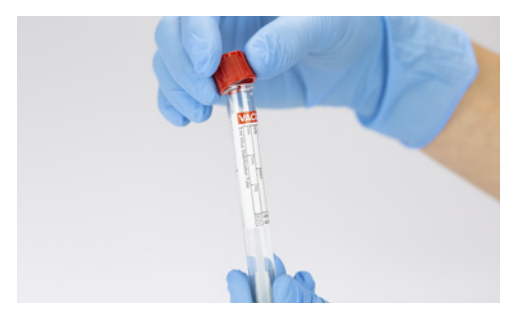
Samplix® Blood Collection Tubes

In the cell and tissue culture field, Greiner Bio-One has supplemented its range of cell strainers with a variation for tubes with limited volumes that enables the processing of small sample volumes. Cell strainers are employed to separate the cells obtained from an organ from other tissue components. In addition, they facilitate the isolation of cells, for example from the immune system, for further examination. This is important for the characterization of cellular surface structures, as for example in COVID-19 research.