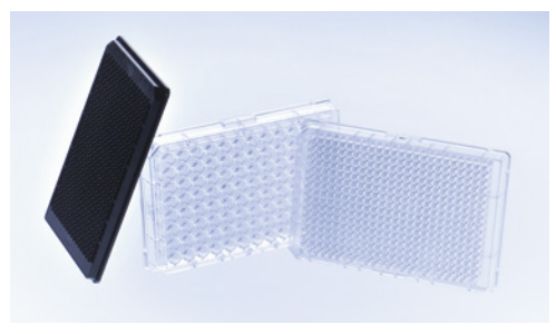
Microplates for high-throughput screening (HTS)

Greiner Bio-One's product portfolio for the variety of activities carried out in laboratories comprises products such as pipettes and pipette tips for handling liquids, as well as small devices that allow work with a wide variety of sample materials.