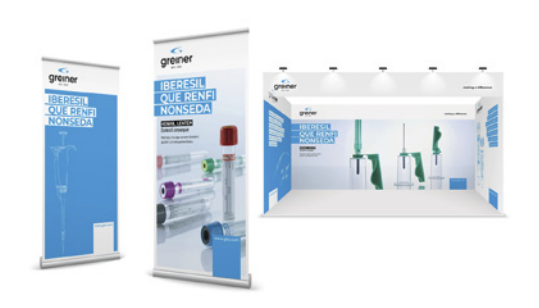
The new, modern appearance