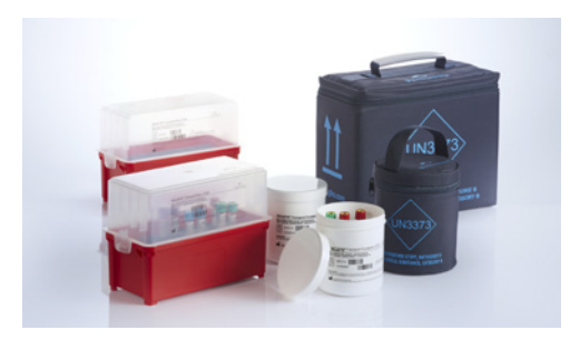
VACUETTE® transport line