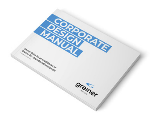
Corporate Design Manual from Greiner Bio-One