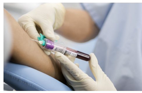
Innovative collection systems for human and veterinary samples from blood, urine and saliva

Greiner Bio-One's third business division is Mediscan , a wholly-owned subsidiary of Greiner Bio-One International with headquarters in Kremsmünster (Austria). Mediscan is a skilled service provider in the field of sterilisation of medical products and food packaging, and also specialises in improving the function of plastics and semiconductors using ionising radiation.