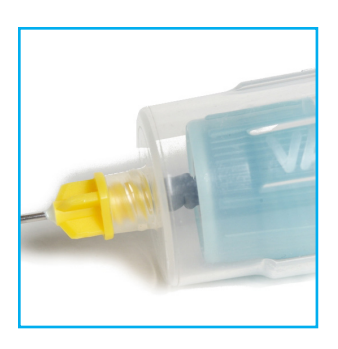
Tube has pushed back in holder causing partial occlusion of blood flow