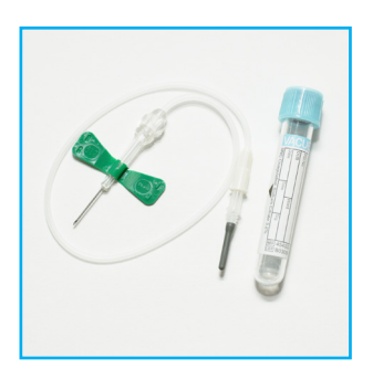
Use a discard tube to draw blood through safety blood collection set tubing prior to filling blood collection tube