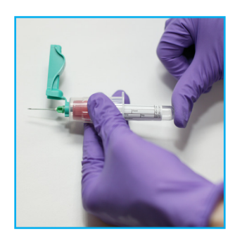
Hold tube in place by pressing it with the thumb to ensure a complete vacuum draw