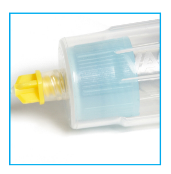
Push the tube forward until the tube stopper is penetrated by the needle