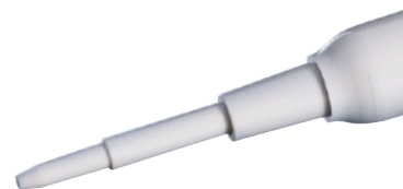
universal tip holder