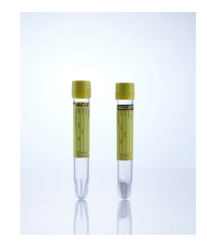
with integrated transfer device (sterile or non-sterile)