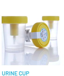
URINE TRANSFER DEVICE

for the convenient sample transfer from the collection vessel