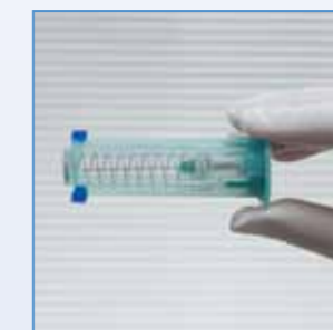
7 Correctly activated TIPGUARD