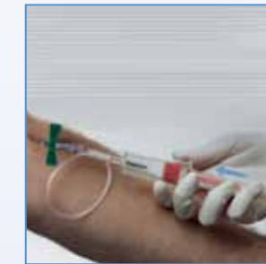
3 Insert the tube