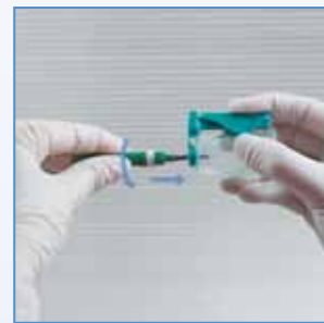
1 Thread the needle