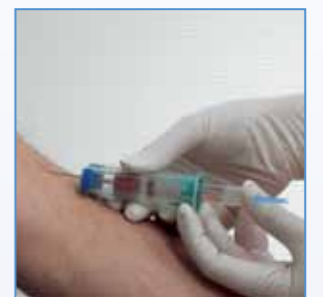
4 Insert the tube