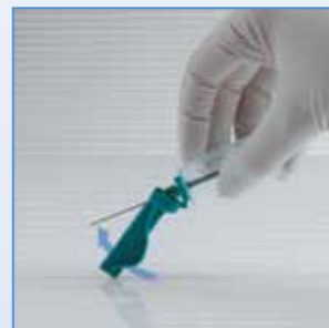
6 Activate the safety mechanism (with the aid of solid surface or thumb)