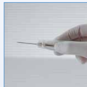
2 Unactivated Safety Needle System