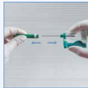
2 Remove protective cap