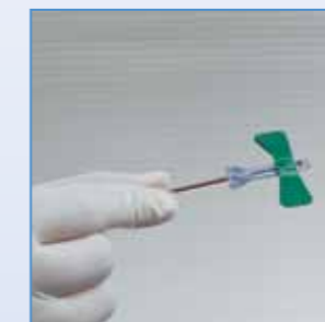
7 Activated Safety Blood Collection Set