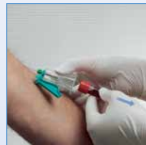
5 Remove the last tube