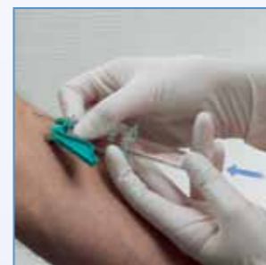
4 Insert the tube