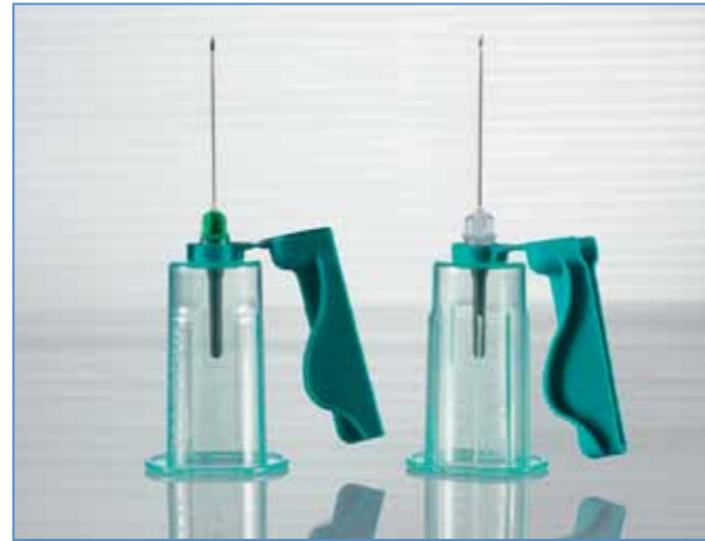
Left: VACUETTE® QUICKSHIELD Complete Right: VACUETTE® QUICKSHIELD Complete PLUS

The VACUETTE® QUICKSHIELD Safety Tube Holder is especially suitable for routine blood collection. There is no change to usual collection technique, and the safety shield is activated one-handed with the aid of solid surface or with the thumb. This product can provide the user with the simplest handling and reliable infection protection. Once activated it is not possible to unthread the used needle, thereby additionally preventing injuries on the backend of the needle sleeve.