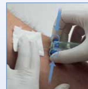
6 Activate the safety-mechanism