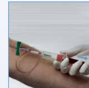
4 Remove the last tube