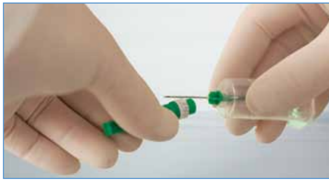
Potential source of danger: Recapping a used needle.

Injuries due to contaminated puncture devices are still the most frequent cause of accidents in hospitals. This is a significant source of danger for many employees in the healthcare industry.