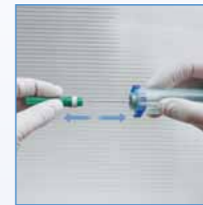
2 Remove protective cap