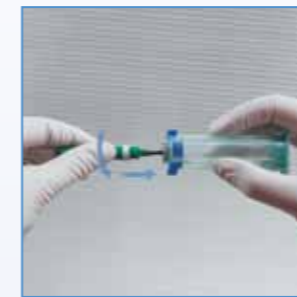
1 Thread the needle