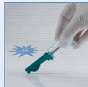
7 Audible click indicates activation