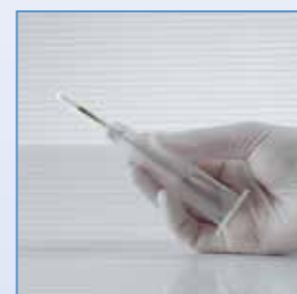
7 Activated system