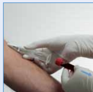
5 Remove the tube