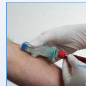
5 Fully remove the last tube