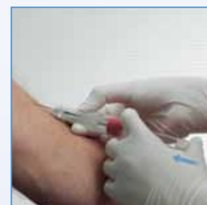
4 Fully insert the tube (activation is automatic)