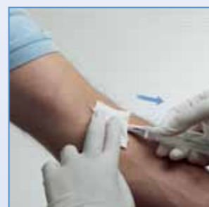
6 Remove the needle from the vein