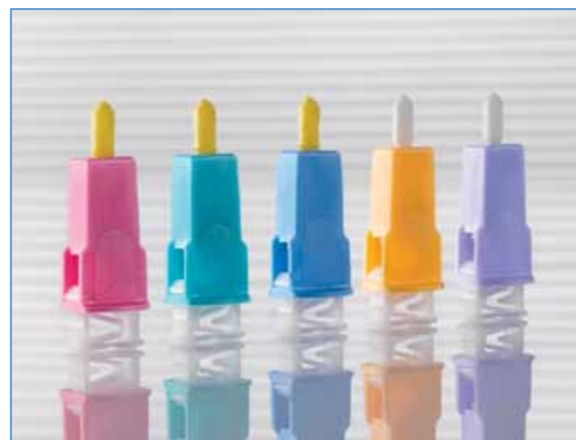
MiniCollect® Safety Lancets left - version with blade (yellow cap)

MiniCollect® Safety Lancets with needle: lavender 1.25mm / 28G, orange 2.25mm / 23G.