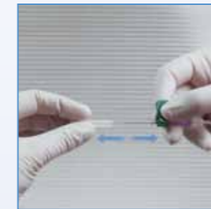
1 Remove protective cap